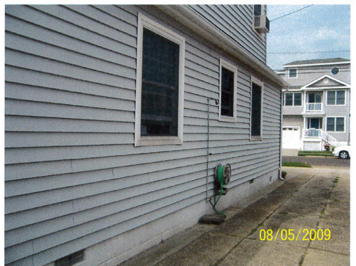
Left Side View – Date of Photograph: (See Photo Stamp)